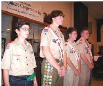
The Girard Boy Scout Troops begin the Craw-Kan Annual Meeting with presentation of the colors.