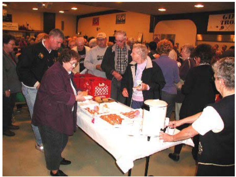
Shown above are members taking advantage of the refreshments at the Craw-Kan Annual Meeting. Shown below is the Holiday Band providing entertainment for the members at the Craw-Kan Annual Meeting.